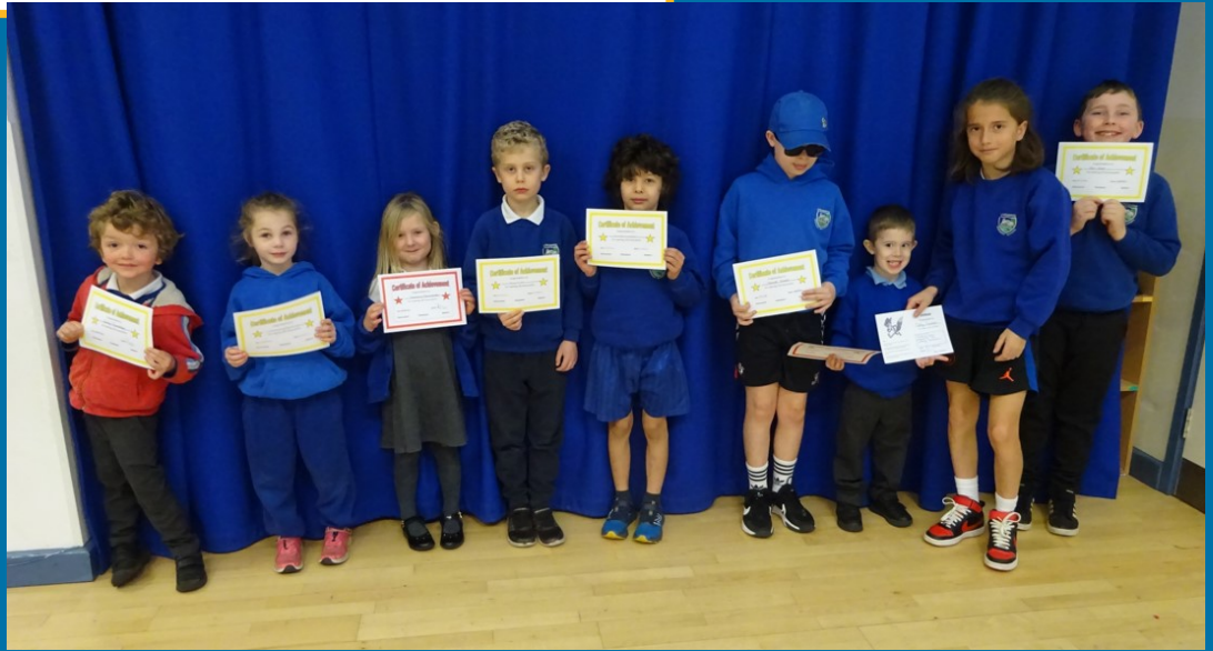
Our House Point Certificate winners for the week.