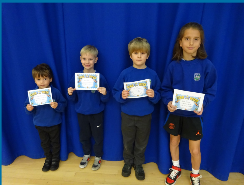
This week's squirrel certificate winners